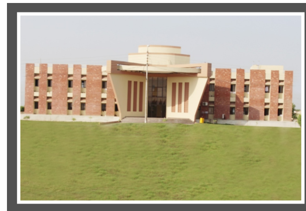
Zulfiqar Ali Bhutto House