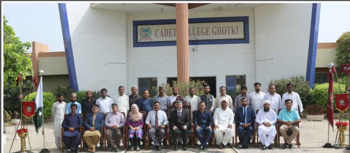
Admin Staff with Principal