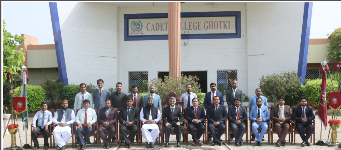
Faculty with Principal