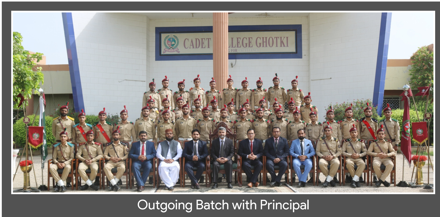
Outgoing Batch with Principal